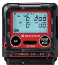
Appearance when attached