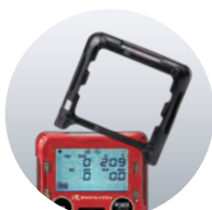
Protective cover (Part No. 4777 4161 10)